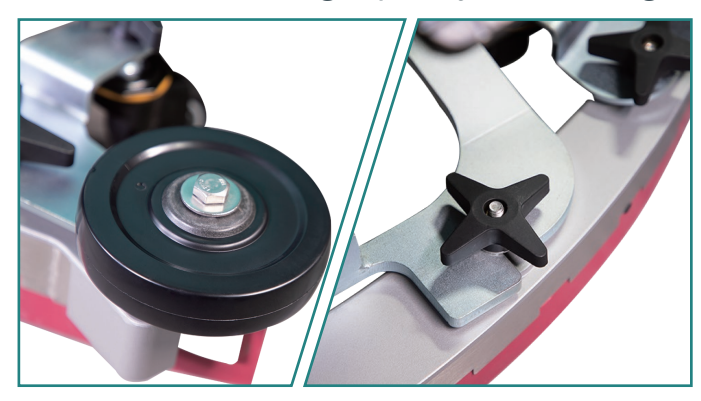
Squeegee assembly/brush cover are both collocated with anti-collision design