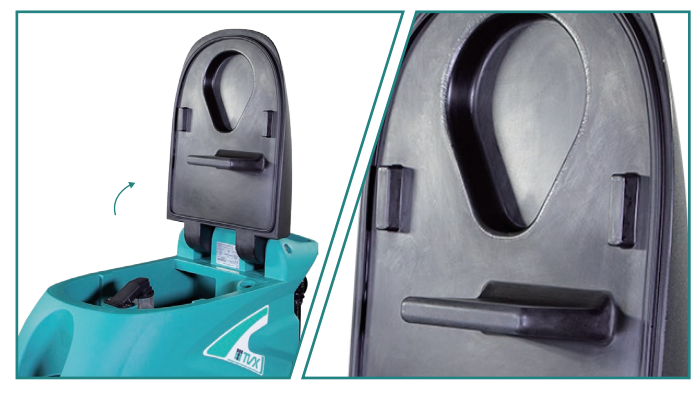
Solution tank can be opened, collocated with high quality sealed-ring