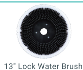
13" Lock Water Brush