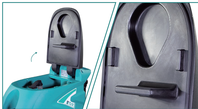
Solution tank can be opened, collocated with high quality sealed-ring