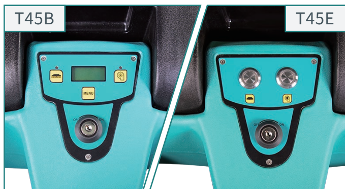
Simple Design Control Panel

Lightweight push back design, not easy to fatigue