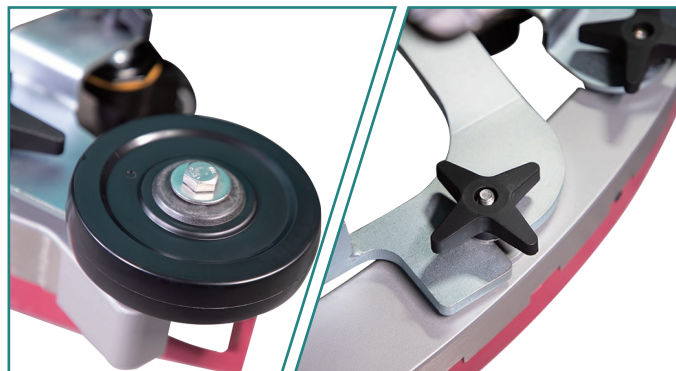
Squeegee assembly/brush cover are both collocated with anti-collision design