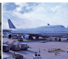
Airport and station